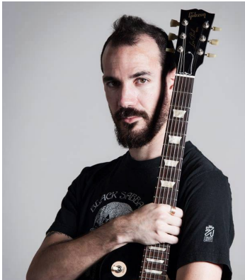
Guitarist, Composer, Producer Born in Viedma, Argentina in 1983 Between Patagonia & México in 2022